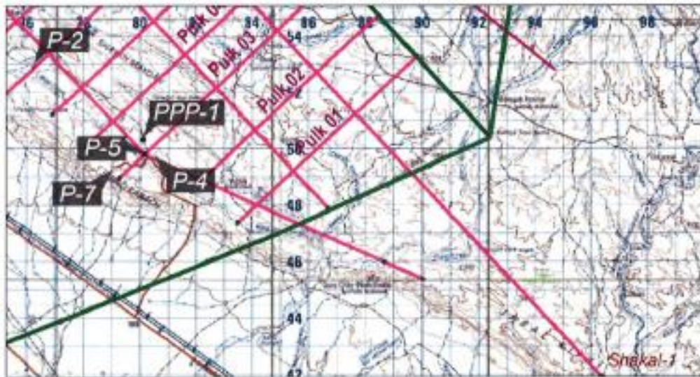
MAP SHOWING THE POSITION OF THE TIE-LINES IN THE SHAKAL BLOCK

1. Acquire and process approximately 18 line kilometres of 2-D seismic in conjunction with the exploration program of Shamaran Pulkhana B.V. in respect of the Pulkhana Block 10, in accordance with the map set out below.